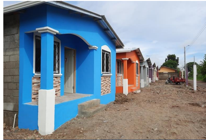
Habitat for Humanity Honduras has supported 276 of the country's 298 local governments in the development of their housing policies. These efforts protect the secure tenure of families.

Women living in rural areas and with lower educational levels are the most vulnerable, due to the lack of community resources and support networks. In addition, the lack of basic services, such as potable water and adequate sanitation, intensifies the domestic burden, with a consequent increase in chronic stress and intra-family conflicts arising from frustration and unmet demands.