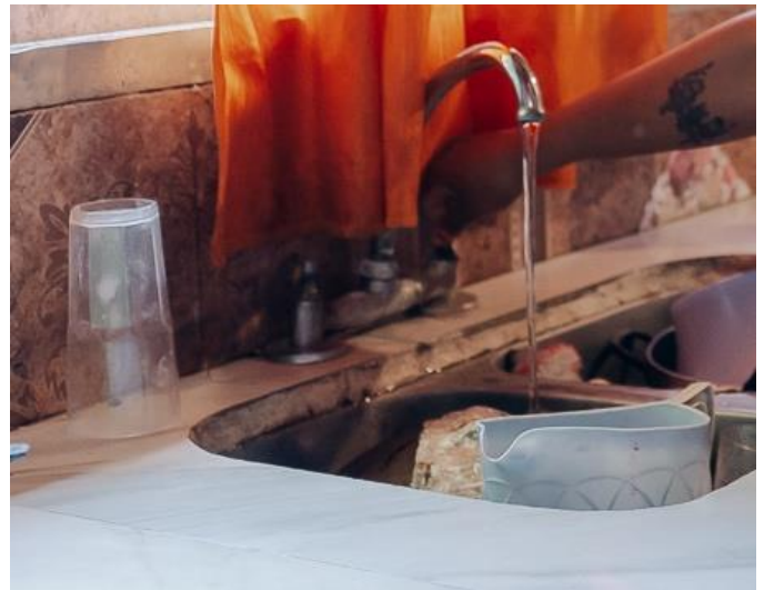
In Argentina, Habitat for Humanity works with families so that they can have access to water and shower safely indoors.

Other factors that prevent domestic violence are precisely those related to housing quality and design. Habitat has a strict policy to adhere to housing quality standards for all its direct and partnering interventions. These standards were designed based on the seven factors of adequate housing proposed by UN-Habitat and contextualized by Habitat to fit the context of each region.