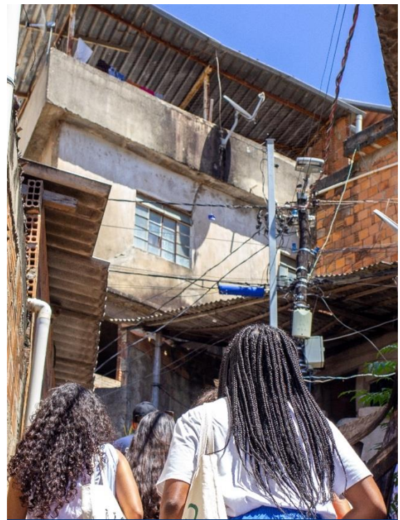
In Minas Gerais, Brazil, residents live in overcrowded conditions.

What is the state of housing and domestic violence in Latin America and the Caribbean?