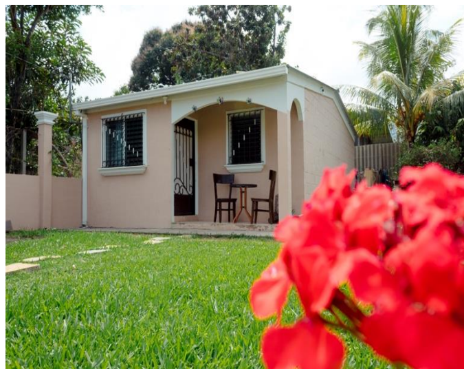
In El Salvador, Habitat for Humanity provides loans to help low-income families improve their homes.

factors on child maltreatment and intimate-partner violence, utilizing data from 200 stay-at-home