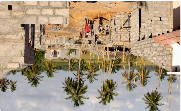
Several organizations are building houses on this site for tsunami victims. Habitat has 25 houses under construction in partnership with MAS Holdings, the largest garment manufacturer in Sri Lanka. The houses are about 500 square feet, as prescribed by the government.

Adequate housing plays a pivotal role after a disaster and is a family's most important asset. Not only does it provide shelter from hazards, but it also is a place to maintain social networks, access city services such as water and sanitation, raise children, make memories, and often conduct business.