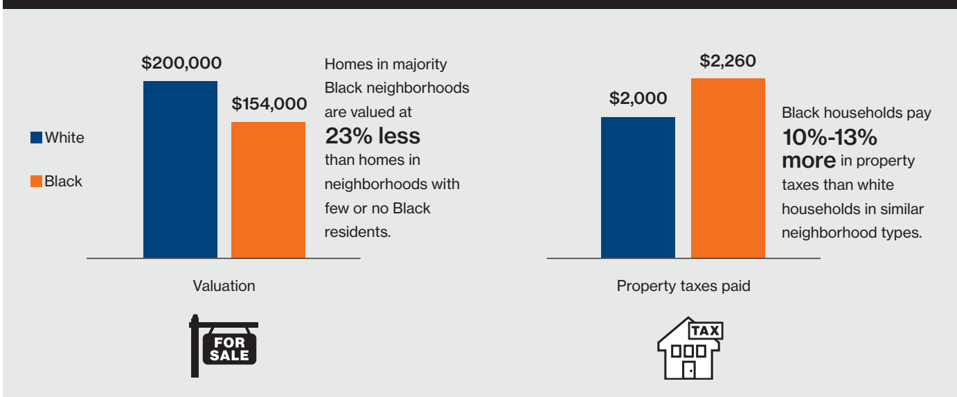
FIGURE 3: BLACK-WHITE GAP IN HOME VALUATION AND PROPERTY TAXES PAID

During the housing boom of the 2000s, subprime loans were disproportionately concentrated in communities of color, and Black and Hispanic/Latinx borrowers were more likely to receive subprime loans and adverse pricing. Subprime lending strips equity with the excessive fees paid to lenders, contributing to an excessive rate of foreclosures. One in 5 subprime loans end in foreclosure.