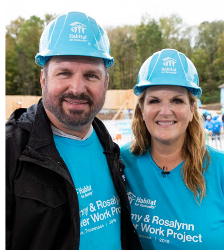
Country music stars Garth Brooks and Trisha Yearwood