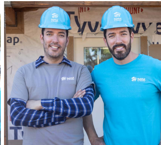
World-renowned construction and real estate experts and HGTV stars Drew and Jonathan Scott