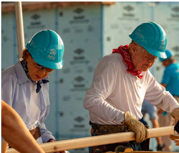
Former U.S. President Jimmy Carter and former first lady Rosalynn Carter