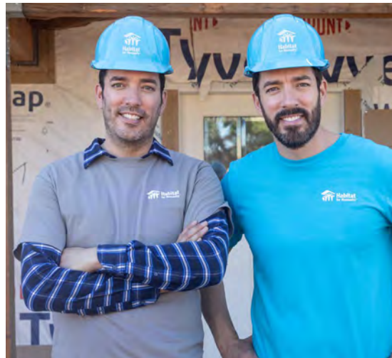
World-renowned construction and real estate experts and HGTV stars Drew and Jonathan Scott