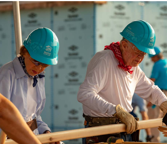
Former U.S. President Jimmy Carter and former first lady Rosalynn Carter