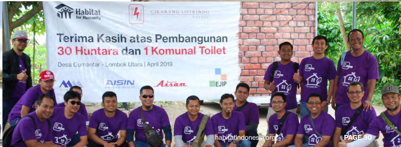
Photographed by Armand P. Pantouw Habitat for Humanity Indonesia