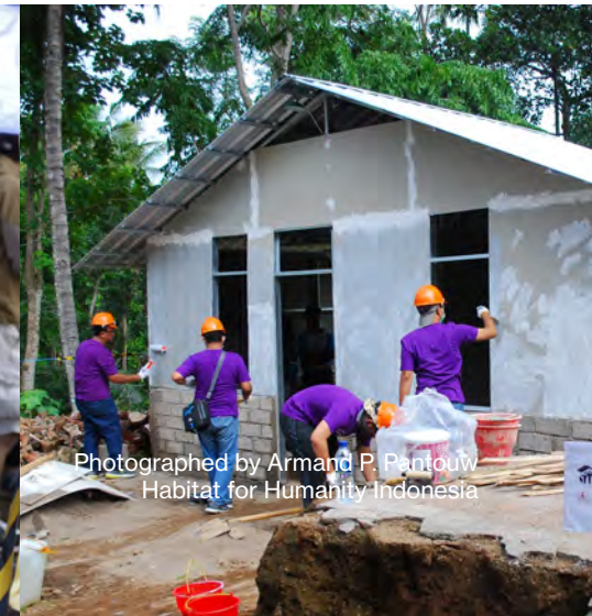
Photographed by Armand P. Pantouw Habitat for Humanity Indonesia